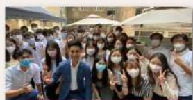
DSE 5** 聚會