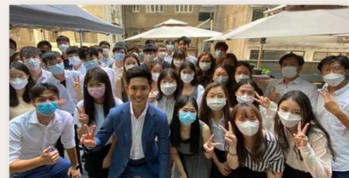
DSE 5** 聚會